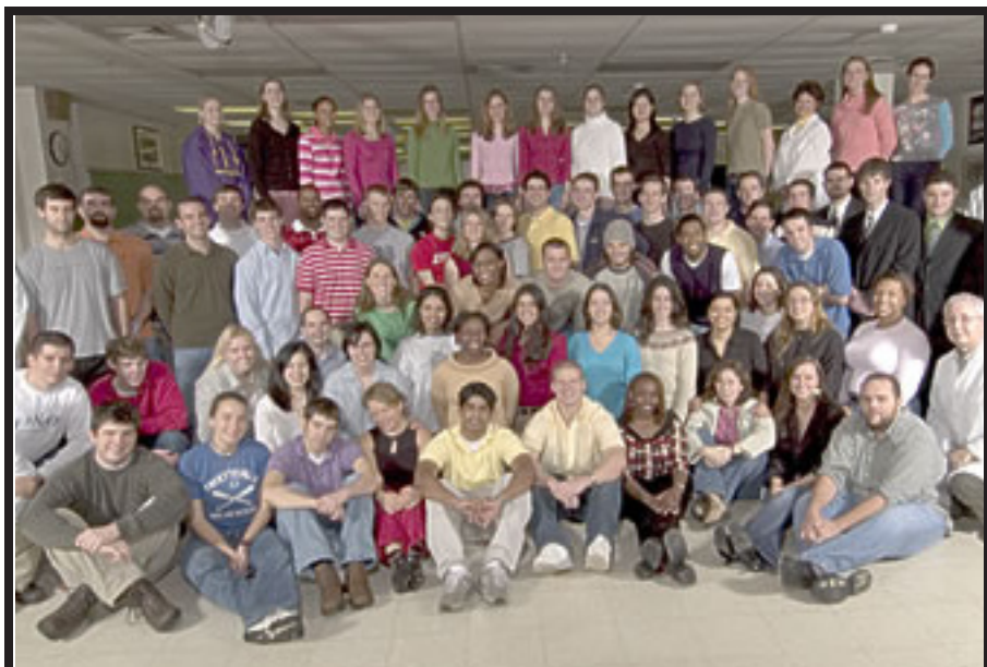
The Brody School of Medicine Class of 2008 poses for the camera. The Class of 2008 has just started their M2 Spring semester and the second half of the pathology course. Can you pick out the future pathologists?